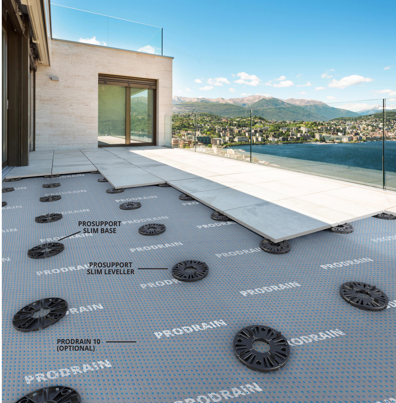
PROSUPPORT SLIM BASE