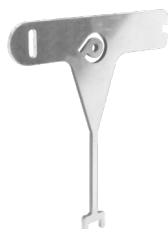
ADJUSTABLE SPACER TABS 4 mm polypropylene - Pack 80 pcs