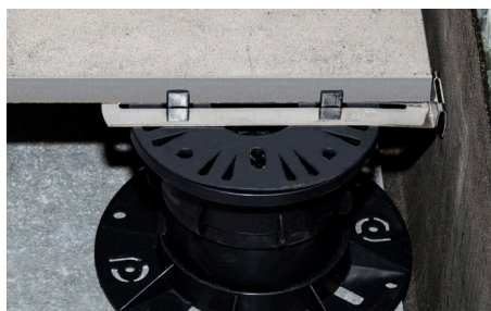
PERIMETER SPACER PROSUPPORT SYSTEM Stainless steel AISI 316L / 1.4404 - V4A - pack. 40 Pcs