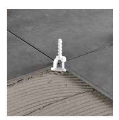
ISTRUZIONI DI POSA

1) Choose the spacer bases in according to the desired laying and joint.