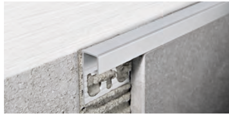
ANODIZED ALUMINIUM thermo Packed (silver-gold-copper-titanium-black) bar length 2,7 lm - Pack 40 Pcs - 108 lm (H 12,5 mm - Pack 20 Pcs - 54 lm)

1. Choose "PROJOLLY SQUARE" according to the tile thickness and desired finish. 2. Cut "PROJOLLY SQUARE" to the desired length and apply the adhesive on the support where the profile will be laid. 3. Press the anchoring flange of "PROJOLLY SQUARE" into the adhesive. 4. Lay the tiles, aligning them with the profile leaving a 2 mm joint. Remove immediately all remains of adhesive from the surface of the profile. 5. Fill the joints between the profile and the tiles with grout, in order to avoid water stagnation. Remove immediately all the remains of grout from the surface of the profile.