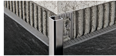
POLISHED ALUMINIUM thermo Packed (chrome- gold- titanium-copper-black) bar length 2,7 lm - Pack 40 Pcs - 108 lm (H 12,5 mm - Pack 20 Pcs - 54 lm)