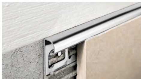
POLISHED STAINLESS STEEL AISI 304/1.4301-V2A with protective film bar length 2,7 lm - pack. 20 Pcs - 54 lm (H 4,5 mm - 108 lm) - 10/10 mm