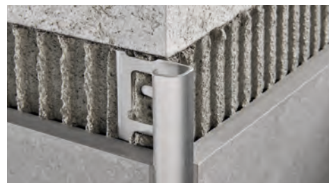
Brushed STAINLESS ST. AISI 304/1.4301-V2A with protective film bar length 2,7 lm - pack. 20 Pcs - 54 lm (H 4,5 mm - 108 lm) - 10/10 mm