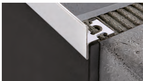
POLISHED STAINLESS ST. AISI 304/1.4301-V2A with protective film bar length 2,7 lm - pack. 15 Pcs - 40,5 lm

POLISHED AND BRUSHED STAINLESS STEEL AISI 304/1.4301-V2A