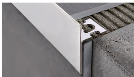
BRUSHED STAINLESS STEEL AISI 304/1.4301-V2A bar length 2,7 lm - pack. 15 Pcs - 40,5 lm