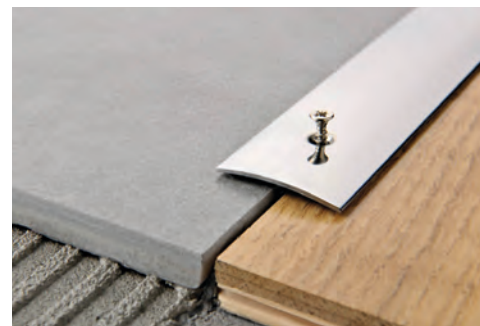
STAINLESS ST. 1.4016 punched - with protective film bar length 2,7 lm - pack. 20 Pcs - 54 lm (L 30 mm - 108 lm)