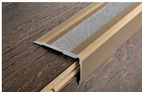
ANODIZED SILVER, GOLD AND BRONZE ALUM. with adhesive thermo packed - bar length 2,7 lm - pack. 20 Pcs - 54 lm

SILVER, GOLD AND BRONZE ANOD. ALUMINIUM + NON-SLIP INSERT ADHESIVE AND PUNCHED