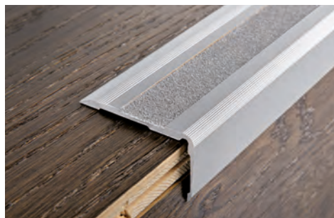
ANODIZED SILVER, GOLD AND BRONZE ALUM. punched thermo packed - bar length 2,7 lm - pack. 20 Pcs - 54 lm