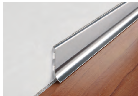
POLISHED STAINLESS STEEL AISI 304/1.4301-V2A with protective film - bar length 2 lm - pack. 25 Pcs - 50 lm