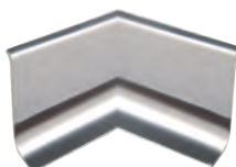
RI... 40/... internal corner