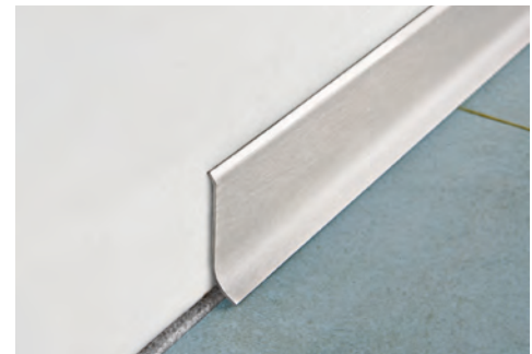
BRUSHED STAINLESS STEEL AISI 304/1.4301-V2A with protective film - bar length 2 lm - pack. 25 Pcs - 50 lm

"A" at the end of the product code = Item with adhesive