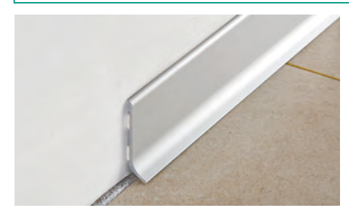
ANODIZED SILVER ALUMINIUM thermo packed

ANODIZED, POLISHED, VARNISHED and BRUSHED ALUMINIUM