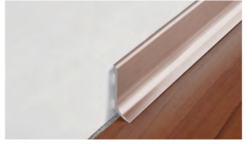
BRUSHED ALUMINIUM (silver-copper-titanium) thermo packed - bar length 2 lm - pack. 40 Pcs - 80 lm

"A" at the end of the product code = Item with adhesive