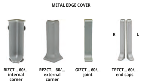
RIZCT... 60/... internal corner REZCT... 60/... external corner GIZCT... 60/... joint TPZCT... 60/... end caps

Available on demand aluminium prewelded internal and external flush corners. Finishing: 01 - 010 - AA - BT - BS - RS - TS. Price to be agreed. Production delay 4/5 weeks.