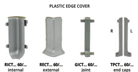
RICT... 60/... internal corner RECT... 60/... external corner GICT... 60/... joint TPCT... 60/... end caps