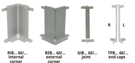
RIB... 60/... internal corner REB... 60/... external corner GIB... 60/... joint TPB... 60/... end caps

*** = Production on demand with minimum quantity of 80 Pcs. Production delay 4/5 weeks. Price to be agreed