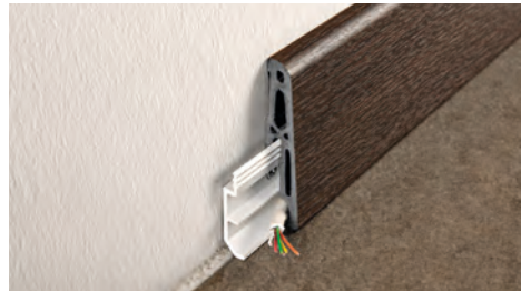
FOAMED VINYL RESIN (wood finishes - black - white and silver) Length = 2,5 m - Pack 20 pcs - 50 lm