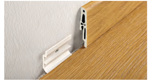
SUPPORT / FIXING CLIP - PLASTIC support Length 5 cm