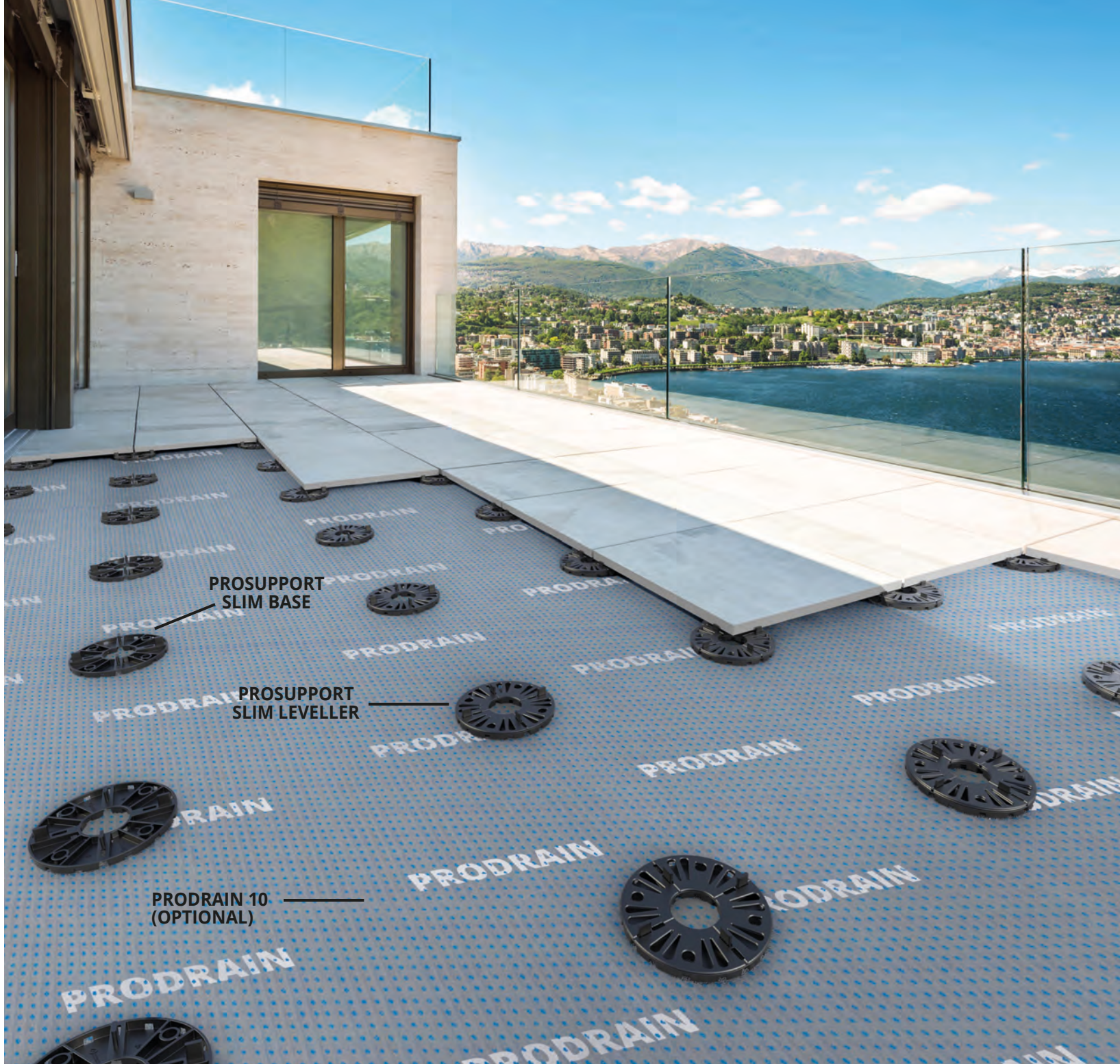
PROSUPPORT SLIM BASE