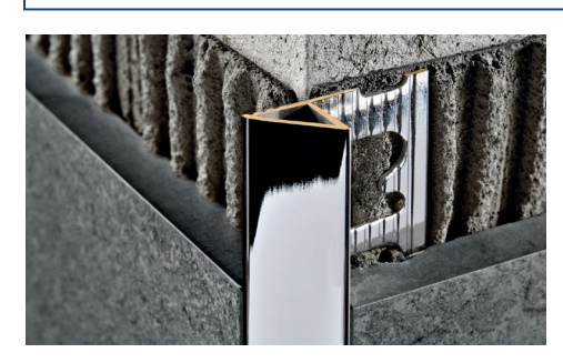
NATURAL BRASS thermo packed bar length 2,7 lm - pack. 20 Pcs - 54 lm

NATURAL, POLISHED VARNISHED, CHROMED AND ANTIQUE BRASS