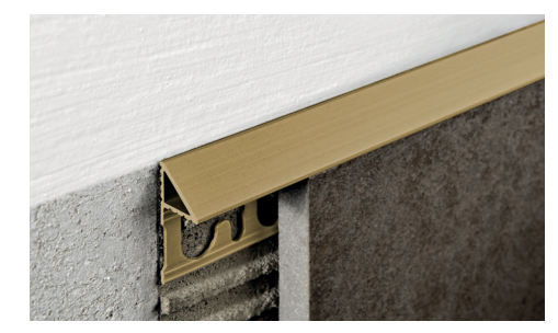
POLISHED VARNISHED BRASS thermo packed bar length 2,7 lm - pack. 20 Pcs - 54 lm