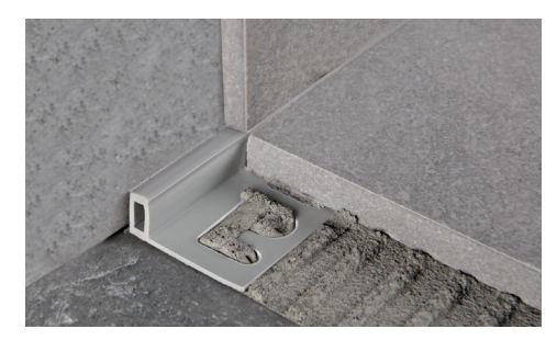
VINYL RESIN - bar length 2,5 lm - pack. 40 Pcs - 100 lm

NON-TOXIC IMPACT-RESISTANT CO-EXTRUDED VINYL RESIN (PVC)