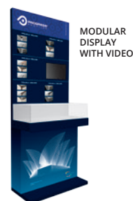
MODULAR DISPLAY WITH VIDEO