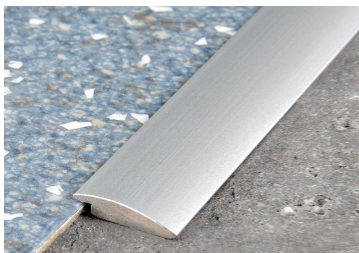
PROLINOLEUM (Page 85)