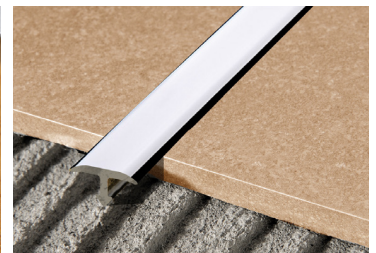
PROCOVER 1045 ALL (Page 86)