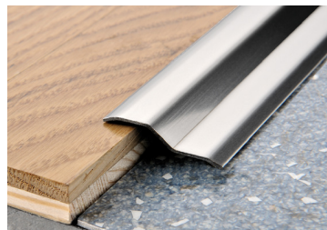
PROFLOOR 24 (Page 85)