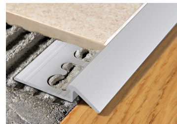
PROSLIDER KL ALL (Page 86)