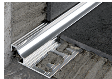
PROSHELL R ALL (Page 159)