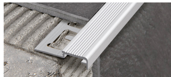
PROSTAIR KL 20 (Page 161)