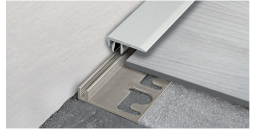
TERMINAL PIN (Page 244)