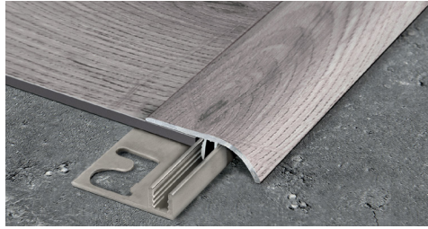
ZERO CURVE (Page 244)