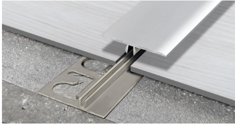
SOL 30P (Page 244)