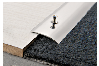
PROLEVALL 305 (Page 80)