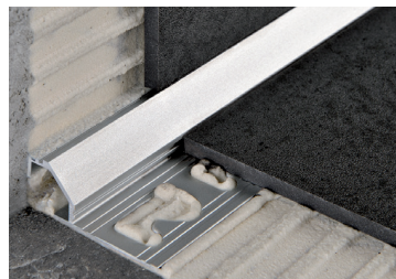
PROSHELL D ALL (Page 159)