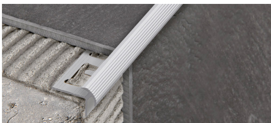
PROSTYLE KL 10 (Page 161)