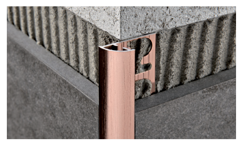
\textbf{BRUSHED POLISHED ALUMINIUM} \ (silver-gold-copper-titanium-black) thermo packed - bar length 2,7 lm - pack. 40 Pcs - 108 lm