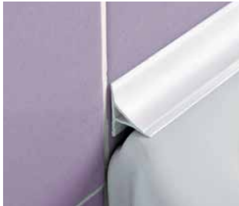
AREAS OF USE

PROBATH is a cove shaped profile in shockproof non-toxic coextruded white vinyl resin. With a visible surface of 16 x 16 and 20 x 20 mm and equipped with an anchoring arrow shaped flange. It is suitable to connect the wall coverings with sink, bath tubs, hydro massage baths and shower trays and thanks to its radius of curvature to guarantee cleanliness and hygiene. The profile is resistant to fungi, bacteria and UV rays. Its particular section and the availability of special pieces, such as internal and external corners, end caps and junctions, make PROBATH a much sought-after and easy to lay profile.