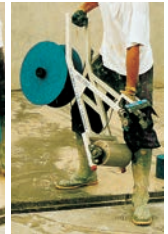
LIGHTWEIGHT FOR MOBILITY