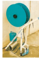
START OF LAYING